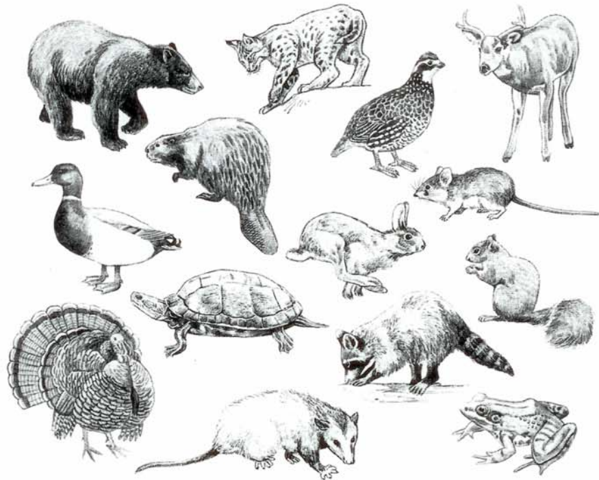
ILLUSTRATIONS BY SAM BEIBERS